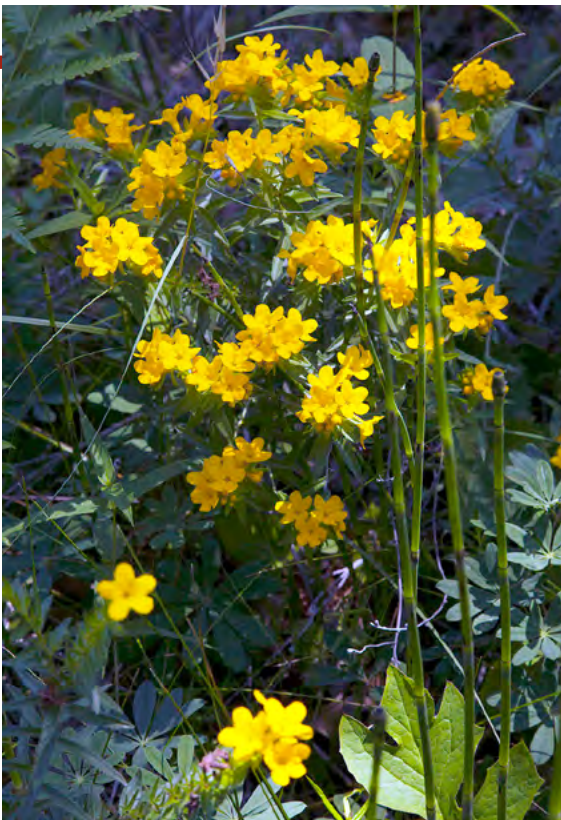
A unique plant at Ivanhoe Nature Preserve, hoary puccoon ( Lithospermum canescens ).