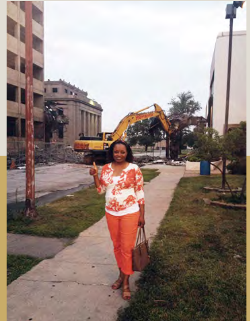
Above: Henry gives a thumbs up, seeing the 14-story dilapidated building coming down, making room for more green in Gary.

tax base, Gary also had little money available in the wake of the downturn to solve some of its biggest problems: blight, water contamination, brownfields, and indoor and outdoor air pollution. Complicating matters, in recent years disillusioned local residents had become skeptical of government solutions that all too frequently did not pan out.