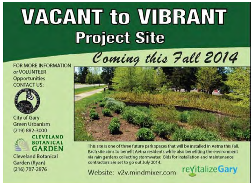
A sign soliciting volunteers highlights a “Vacant to Vibrant” project site in one of Gary’s neighborhoods.

One of the tree planting projects was with the Benjamin Banneker Achievement Center (a kindergarten through grade eight school).