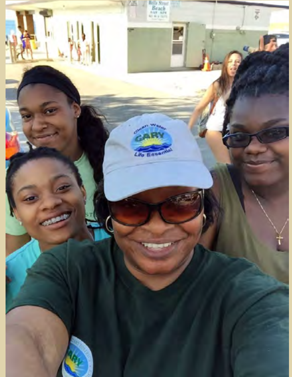
These young ladies have worked with Green Urbanism for years as Clean Water Volunteers. Now they’re working with Gary Parks Department to increase youth volunteerism in keeping their beach shores clean. (Facebook photo courtesy of the Gary Department of Green Urbanism and Stormwater).

Henry shared her vision for a greener Gary: “I would like it to take advantage of our natural resources and incorporate a lot of green and open space. Improving those natural assets will position our city for future economic development and a diversified economy. Showing the benefits of ‘green and clean’ positions us to bring in the type of development we want for our city.”